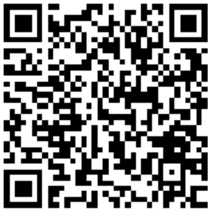
Tric a Chlic Songs